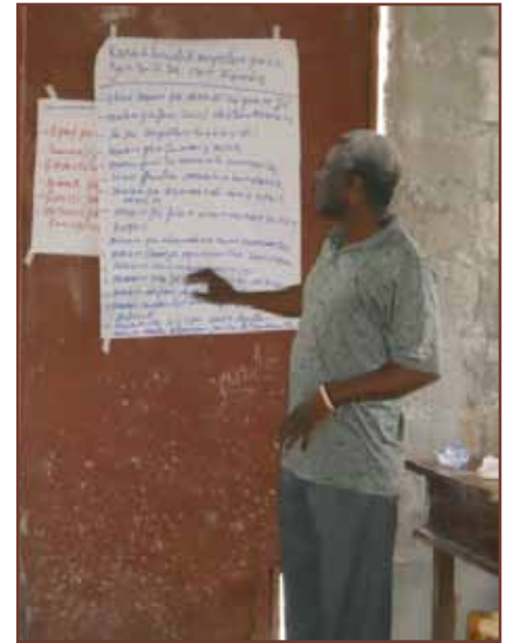
A teacher gives instruction during a session of micro-loan training.

HFH has set a goal of raising $17,500 to provide funds for these loans. The first $10,000 has already been given, leaving $7,500 to complete the goal. Would you like to help meet this goal? You can donate online at haitifoundationofhope.org .