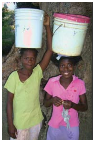
These girls have finished primary school in Terre Blanche and are ready to start seventh grade.