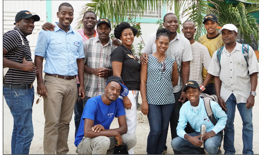
Translators and medical staff at the Clinic of Hope.