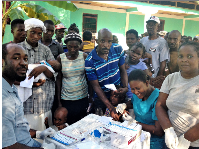
Staff from the Clinic of Hope work at a remote clinic in a nearby community.

The school in Terre Blanche is open with 870 students enrolled in pre-kindergarten through secondary school. Lunch is provided to each student and is an essential part of the day.